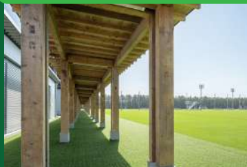
The same lumber from the prefecture that was used in the Olympics

Utilizing the same local materials that were a part of the legacy of the Tokyo Olympic and Paralympic Athletes' Village Plaza