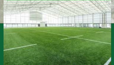
Indoor practice field

Exactly measured dimensions that can be used for pitching